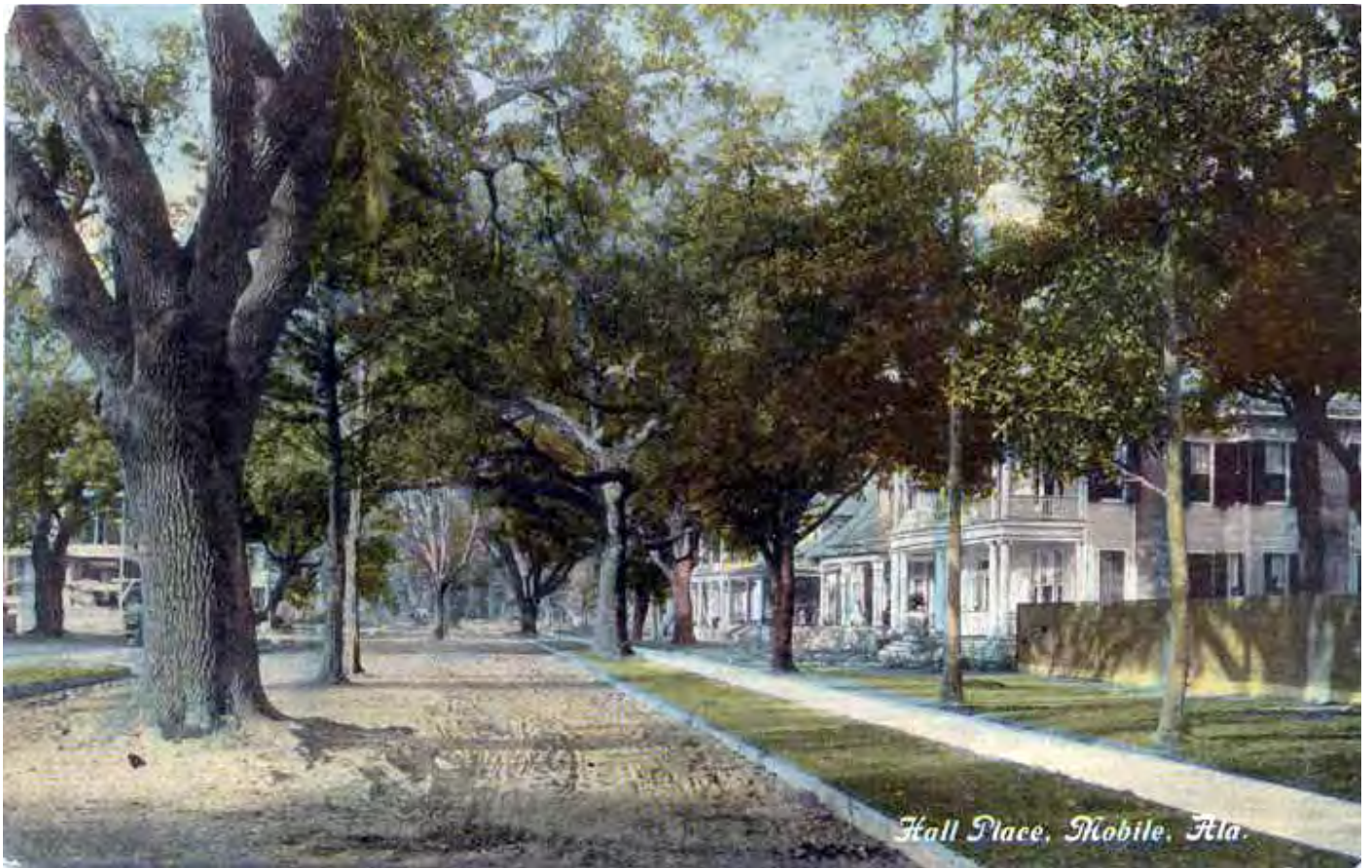
Hall Place (Monterey Street), looking north towards Old Shell Road, from Dauphin Street. 1900-1919