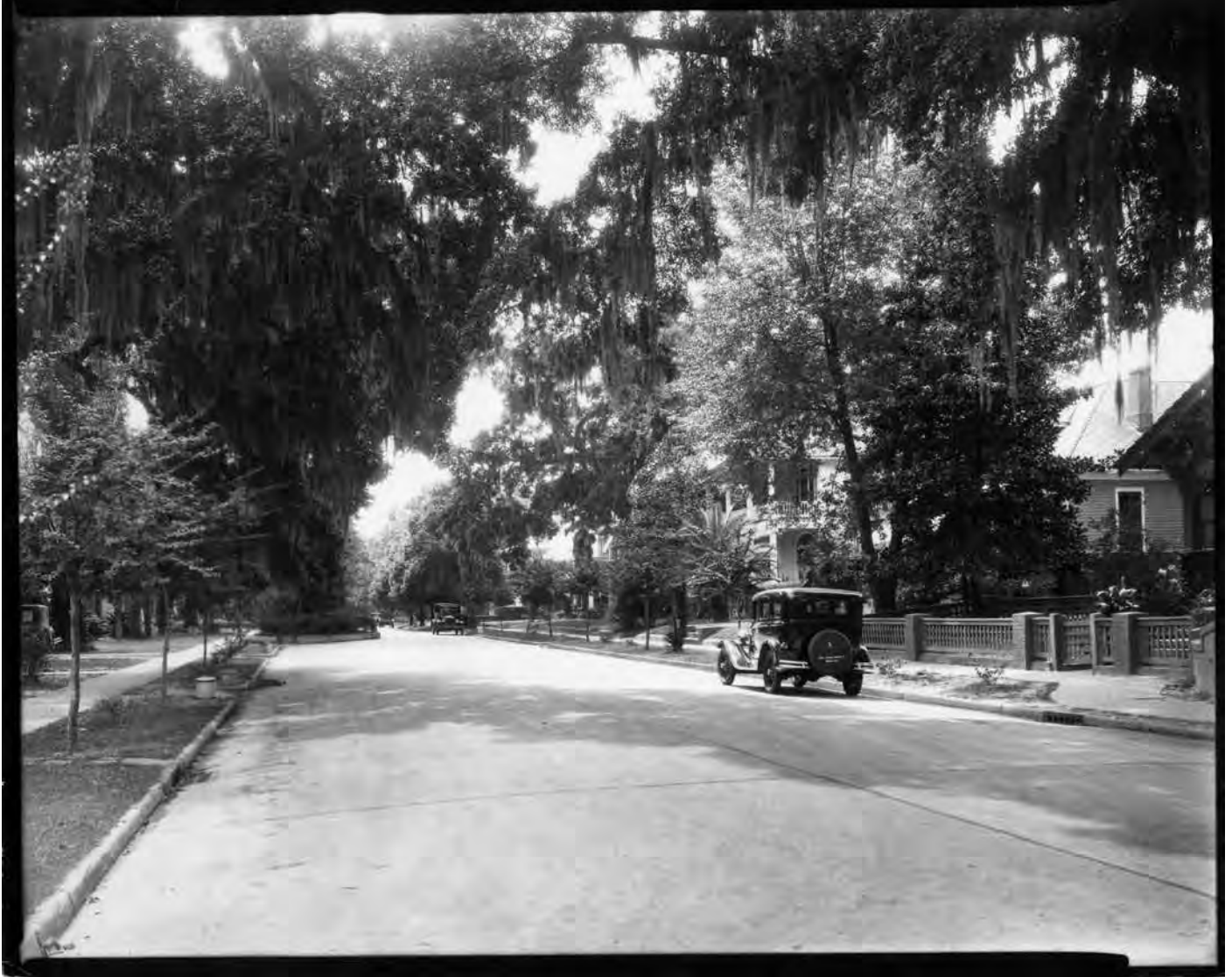
Monterey Street, looking south towards Dauphin Street, from Old Shell Road. Negative N-3248C.

which still remain) were planted down the center of the concourse, and sidewalks and other ground improvements were made with the city's full cooperation.