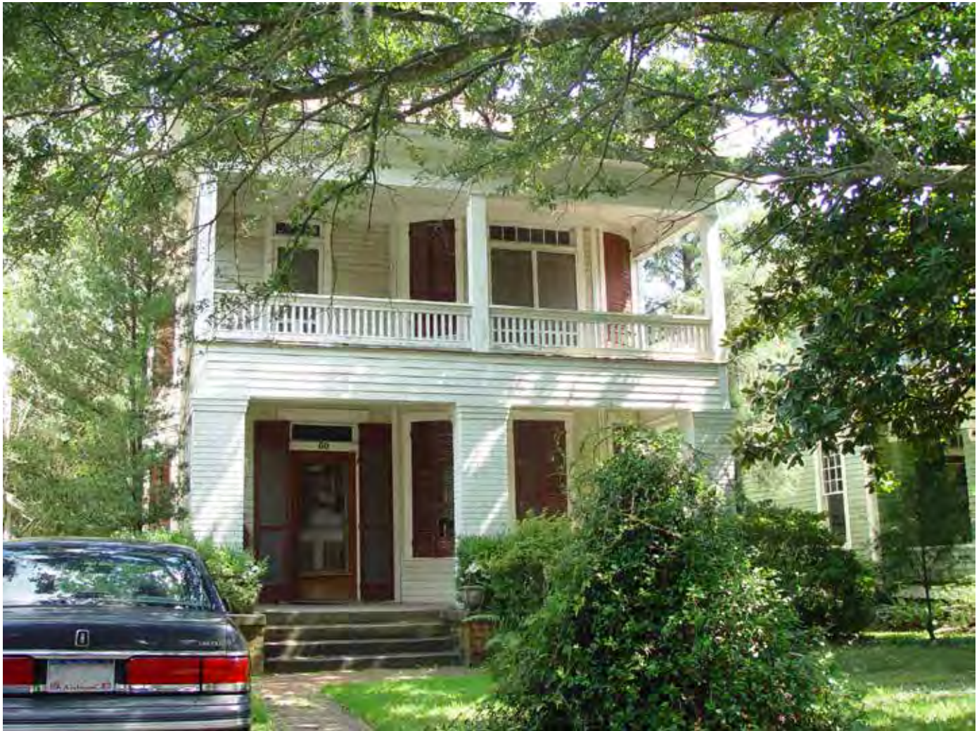
Facing page: A sign of the horseback era still exists on the street; Above: #60, the Higginbotham house.

and more houses have been placed on the National Register of Historic Homes. At present, 22 of the 34 houses of Monterey North have made the register and many of the remainder are eligible.