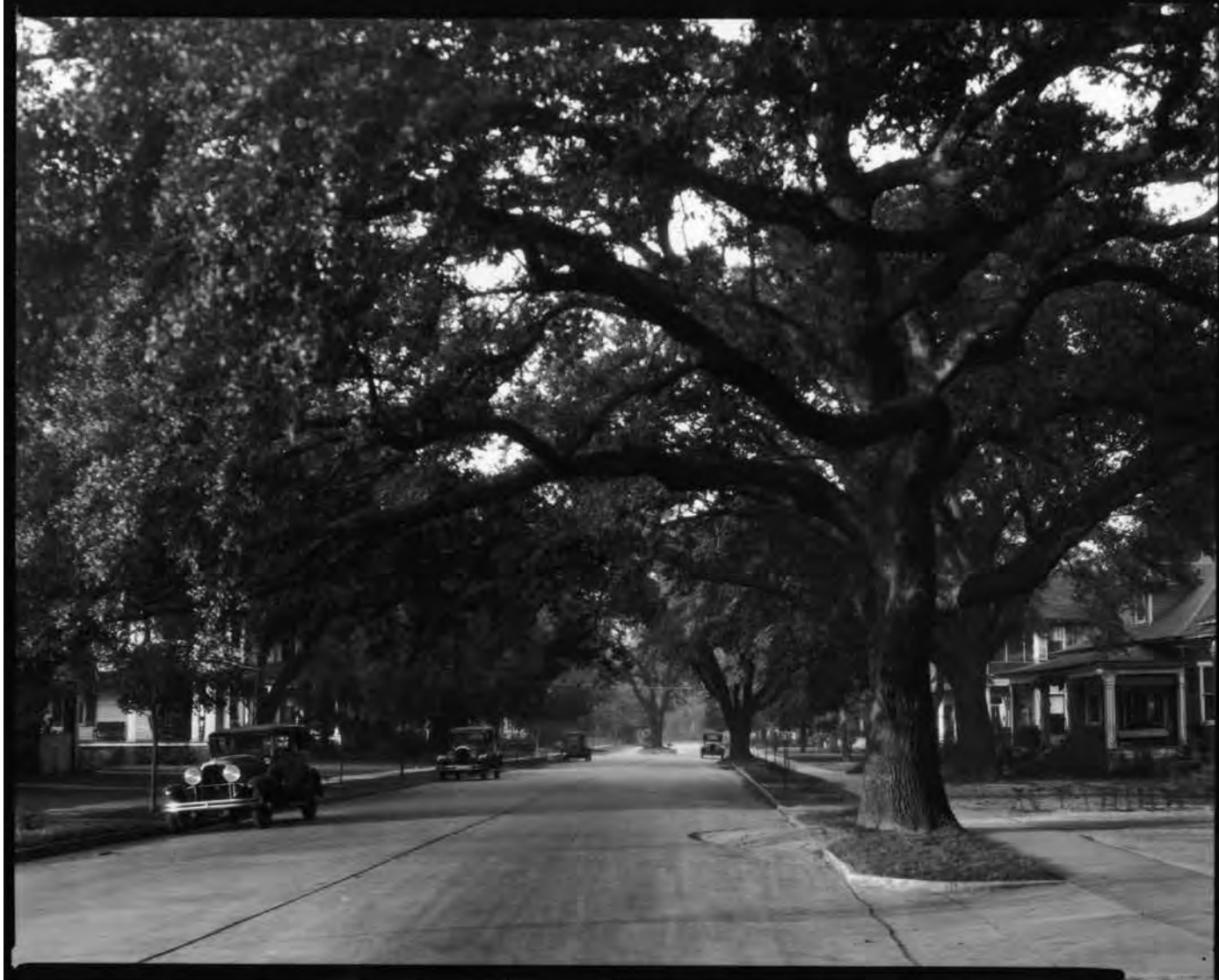
Monterey Street, looking north towards Old Shell Road, from Dauphin Street. Negative N-3253.