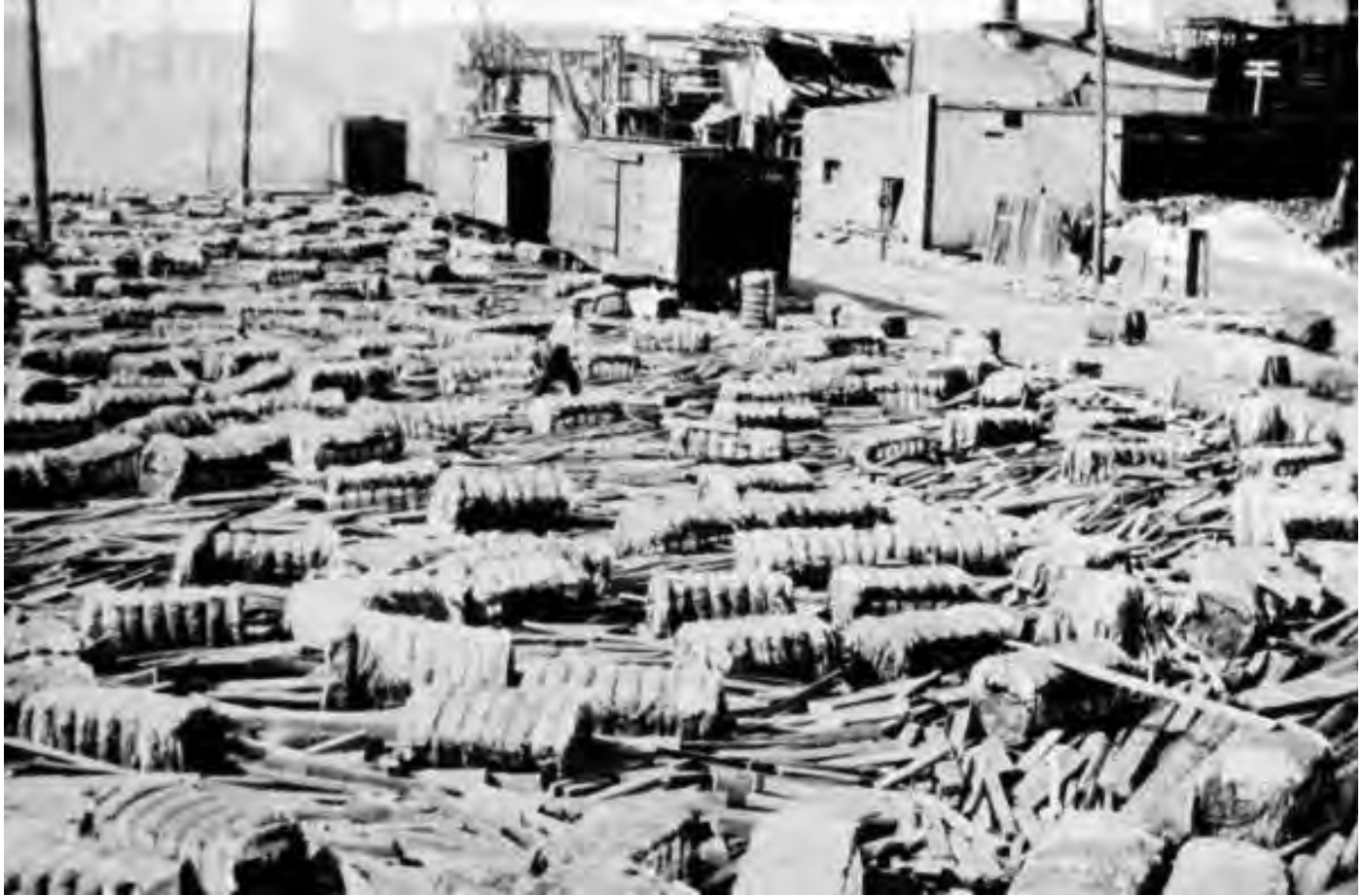
Cotton bales and other debris on tracks of Southern Railway in Mobile From: "The Floods of July, 1916", copyright 1917, Southern Railway Company. Library Call Number F215.F55 1917. Courtesy NOAA.