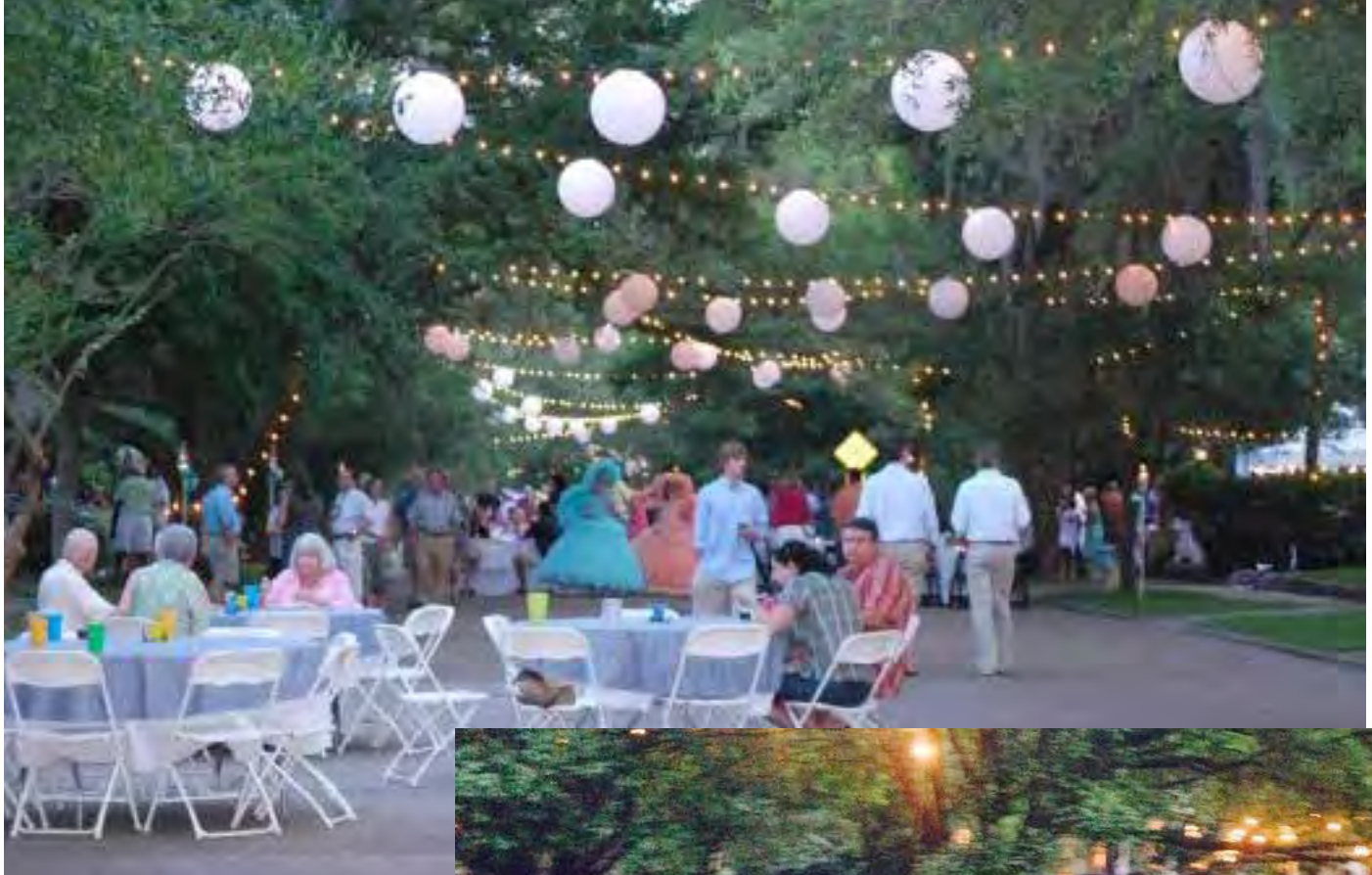
Above: 2009 Monterey Street's annual street party; at right: 2015, the Azalea Trail Maids always make an appearance at the party, even when it rains.